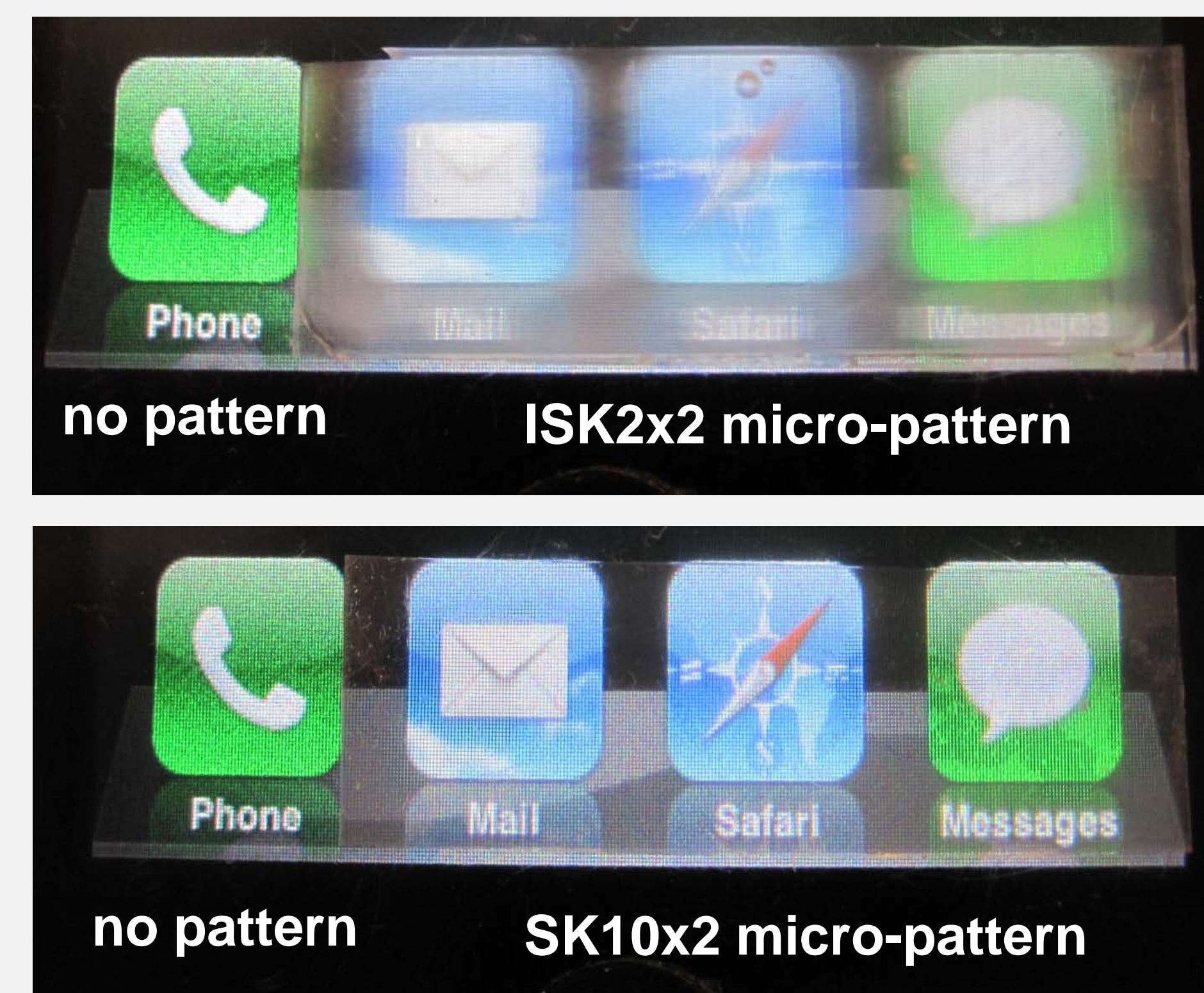
Figure 3. The SK10x2 offers improved optical clarity over the ISK2x2 Sharklet micro-pattern. The ISK2x2 micro-patterned film (top panel) distorts the resolution of the right three icons compared to the uncovered icon on the far left when placed on top of a phone touch-screen display; the SK10x2 patterned film (bottom panel) does not distort the resolution when placed onto the same touch-screen display.